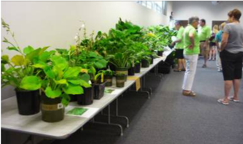
Phyllis Weidman talks with Sandy Honaker. Behind them hostas line the wall waiting their turn on the auction block.