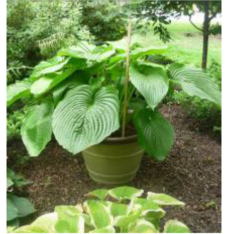
H. 'Empress Wu' , donated by Jeff and Kelly Hall, measured over 32 inches tall. It was too large to transport to the auction site!