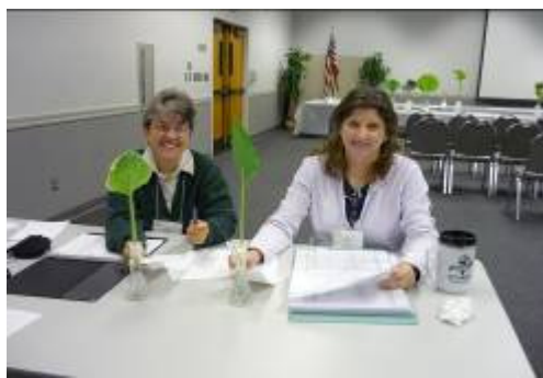
Classification clerks