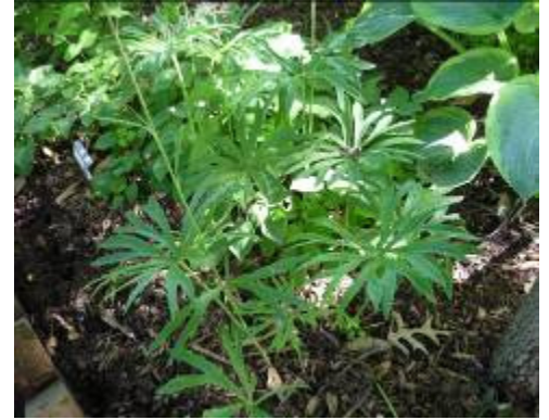
Mature plant with insignificant flowers not yet in bloom – picture taken May 28

Species: aconitifolia (a-kon-eye-tih-FOH-lee-uh)