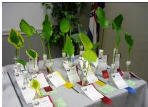
Leaf table embellished with ribbons