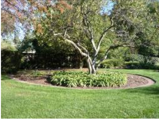
Missouri Botanical Garden hosta bed 05