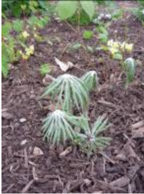
Newly emerged plant – picture taken April 6