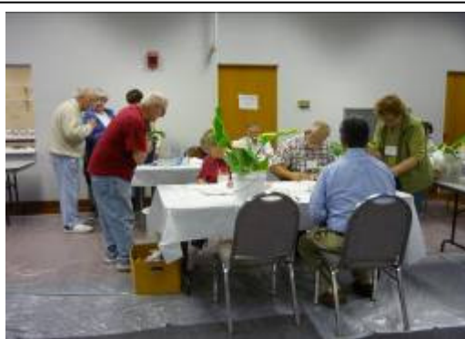
Leaf Preparation area