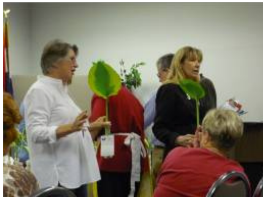
Judges explain their grading decisions.