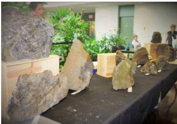
Ted Peikutowski has a new hobby! Ted carves lava rock into different size and shape planters and decorative faces that can add whimsy to your garden.