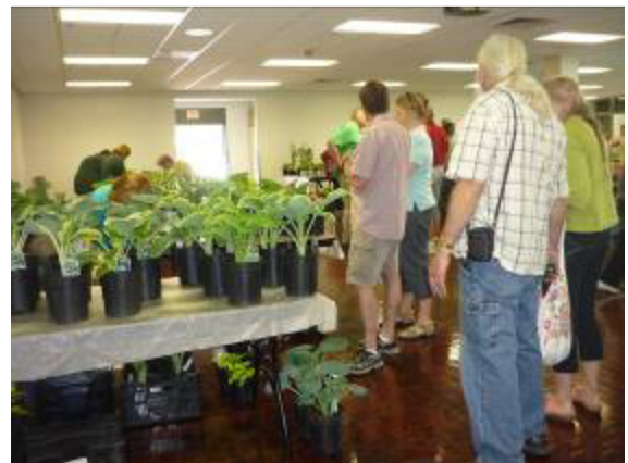
Customers appear to be wondering where to start. Because of the early spring, shoppers were in the mood to start filling the empty spots in their gardens.