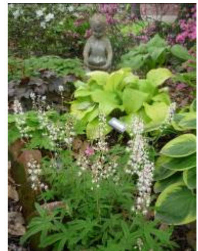
Tiareella 'Lace Carpet'