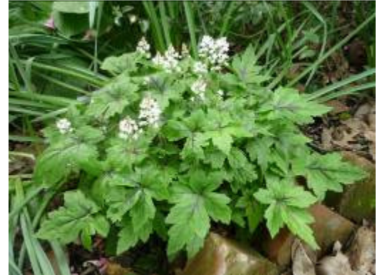
Tiareella 'Crow Feathers'

Tiareellas are valuable plants that can be used to bring variety to the shade garden, complementing the textures of ferns, heucheras, hostas and other shade lovers.