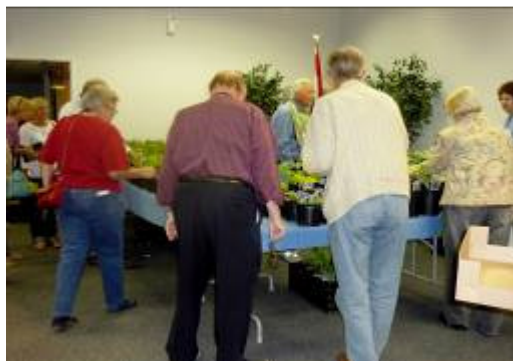
Homestead Farms is a very busy place.

Thanks to all our vendors and our members for their support.