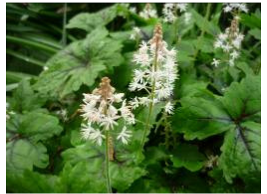
Tiareella 'Crow Feathers' flower stalks