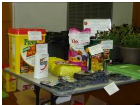
Products displayed by Overland Hardware