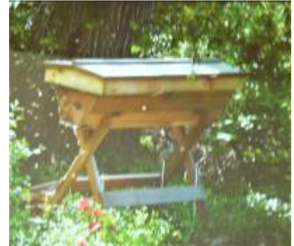
Top Bar Hive