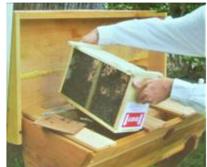
Bees being released from a purchased "bee package".