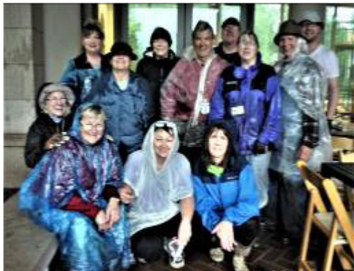
The 2017 work crew