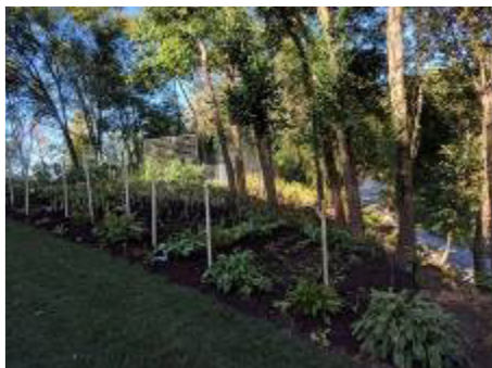
Hostas on the Bluff hosta beds.