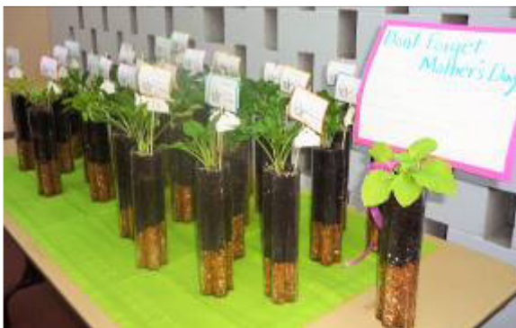
For our 2014 sale, which occurred Mother's Day weekend, Karen Frimel placed mini hostas in glass cylinders. Many a special mom received one of these unique gifts.