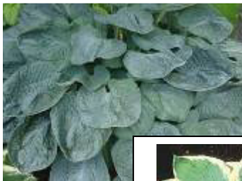
H. 'Blueberry Waffles'