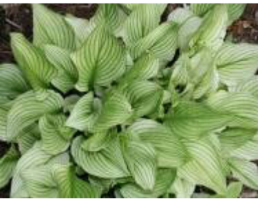
H 'Zebra Stripes'