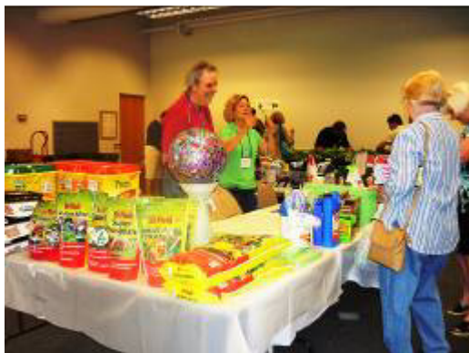
Overland Hardware display 2014