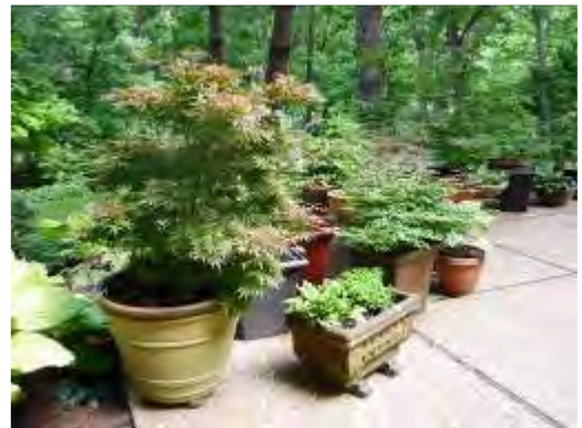
Some of Kelly's Japanese maples

Japanese maples are versatile trees that can grow in the ground or in pots. They add a special touch to a hosta bed and can be used as a focal point in your shade garden.