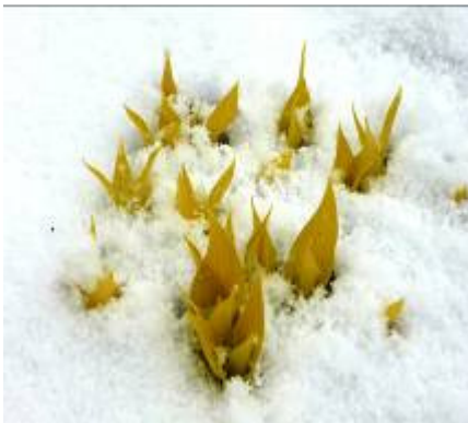
h.'Little Miss Magic'

While you're busy brushing off the snow, check if that emerging hosta can be divided.