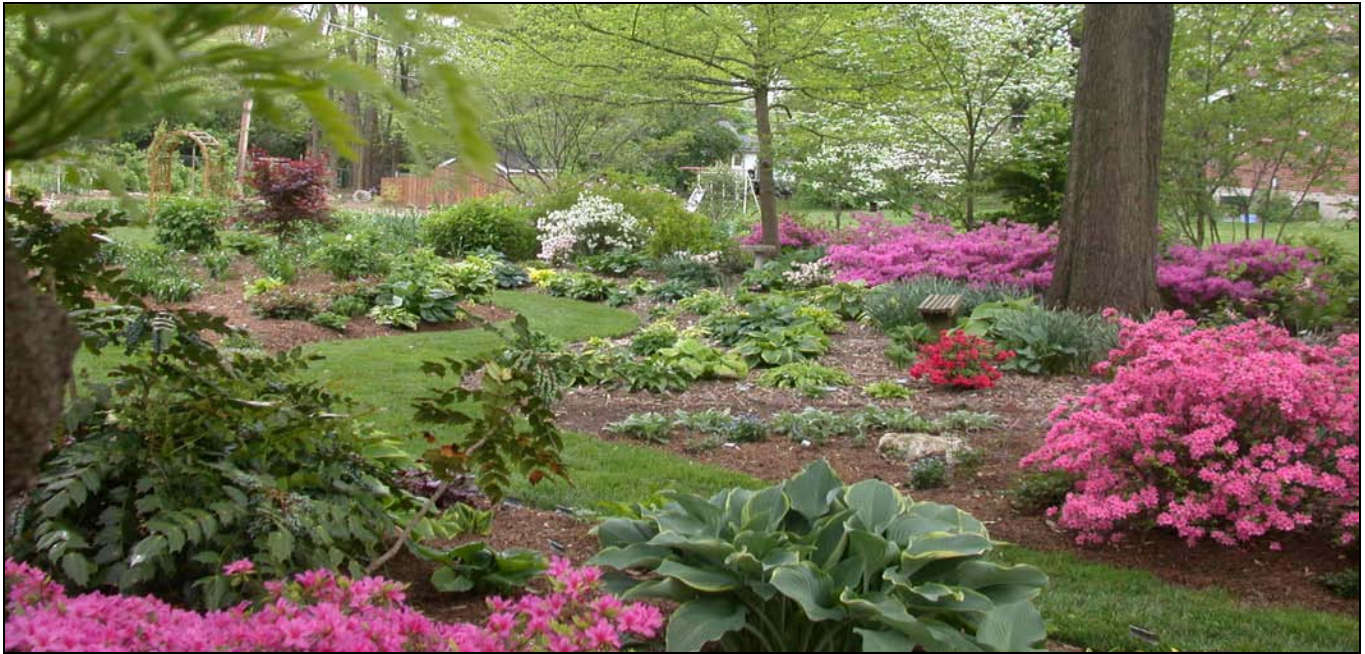
Azaleas in Poos Garden