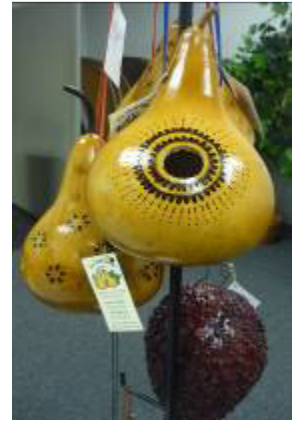
Bottle gourds as attractive birdhouses.

Gourds are hybrids so their seeds might produce surprises. Each gourd has a unique personality and shape that inspires creativity. This is what draws artists such as the Gourd Sisters to this medium - possibilities unlimited