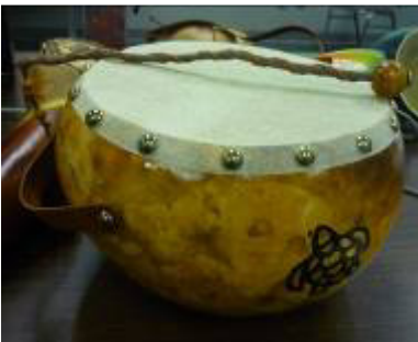
Basket gourd fashioned into a drum.