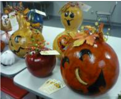
Bottle and basket gourds decorated for the holidays.