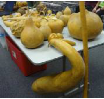
The raw material, ready for an artist's hand. Note the different types – bottle, dipper, snake and basket