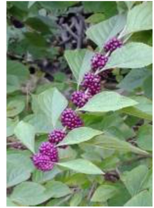
Callicarpa berry clusters

Gone are the flowers of summer. Hostas are headed toward dormancy. Tinges of red, yellow and orange edge the tree leaves. Fall has arrived with winter fast on her heels.