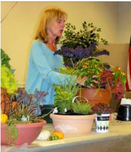
Then she did some magic.