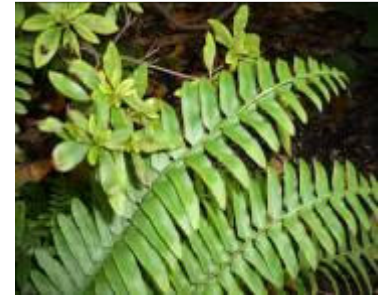
Close-up photo of Christmas fern from Poos garden

St. Louis Missouri Botanical Garden 'Plant of Merit'