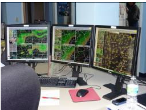
Just a few of the many computer screens displaying climate and weather related information.

The Service also issues Warnings. These cover events such as tornadoes, severe thunderstorms, flooding, high winds, frost/freeze conditions and winter storm alerts. Due to its size and latitude, the United States is number one in the number of serious weather related events per year.