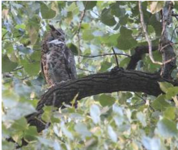
Great Horned Owl camouflaged.