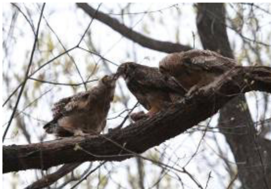
Caring for owlets