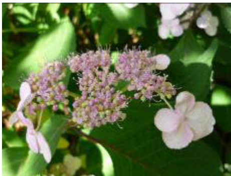
Hydrangea 'Lady in Red'