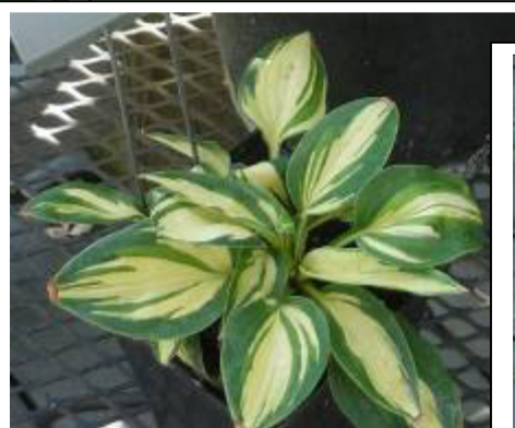
H. 'Light of Day'