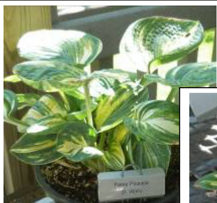
H. 'Pablo Picasso'

Yes, there are exciting new developments coming for our beloved hostas. We have not reached the pinnacle yet, nor will we ever. Just keep dreaming and eventually our enterprising hybridizers will make those dreams come true!