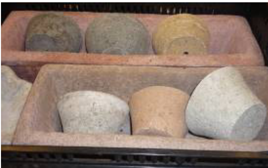
Some of Lee's smaller papercrete pots.