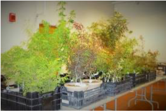
Selection of Japanese maples, dwarf conifers and ginkgoes brought by Lee.