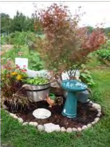
Carolyn's Garden displays flowers and a Japanese maple in addition to her many vegetables.

Besides being a public demonstration garden, Bell has also been an active community garden for over 20 years. Family members tend plots that allow them to grow fresh vegetables in an economical way. They share their knowledge with other family members and friends. Vegetable and ornamental plants and seeds and some tools, if needed, are provided by Gateway Greening.