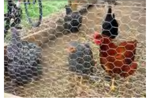
Plymouth Rock, Black Australorp and Rhode Island Red chickens

We were greeted with the friendly cheeping of the newest addition to Bell Gardens. These particular breeds were chosen because they are winter hardy and excellent layers. Each day volunteers collect and distribute the various colored eggs.